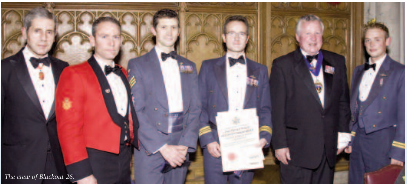
The crew of Blackout 26.

of the aircraft downwash but slow enough to keep within the confines of the road and maintain forward references. This fatiguing configuration was maintained for a further 23 miles at an average GS of 40 kts. The incident location was observed from numerous vehicle lights and the troops showed 'firefly' lights to mark the landing site. Because of the snow the Handling Pilot used a line of three vehicles (lit but abandoned in the water) as a horizon bar for a crosswind whiteout landing. References were lost at 20 ft from touchdown so attitude was maintained and the landing speed/drift corrected with reference to the hover meter. While the medics and No 1 crewman dealt with what turned out to be 17 casualties, the decision was made to return to Kandahar IFR, rather than push on to Qalat, the troops choice. Departure had to be made on landing heading toward the high ground, until the snow cloud was cleared and some forward speed achieved in order to make a turn to heading (through 100 degrees). A maximum rate climb to 9,000 ft was then made and an uneventful return to base. Inflight visibility rules were broken more often than not during the rescue – all the aircrew had previously found themselves in similar conditions during their flying careers, but not in such poor light levels, or for such a protracted period of time. The equipment, training and individual crew performance was the difference between success and abandoning the rescue with one life, possibly two, saved.