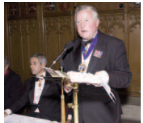
Wise words: the Master makes his address.