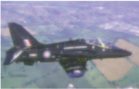
Feeling sick: the Aviation Medicine Flight's Hawk is used to help desensitize aircrew affected by airsickness, a process that can take up to three months and involve more than twenty flights in the aircraft.